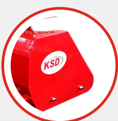
Heavy Duty Side Body

*The company reserves the right to change the product specifications without any prior notice.