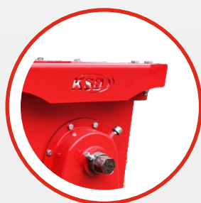
Heavy Duty Side Body

ONE OF THE LARGEST MANUFACTURER IN THE REGION