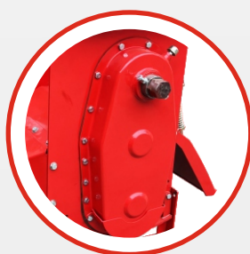
Heavy Duty Side Cover